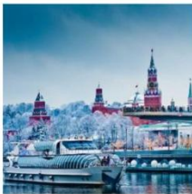
Moskva river cruise