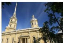
Peter and Paul Cathedral