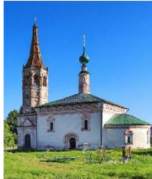
St Nicholas church