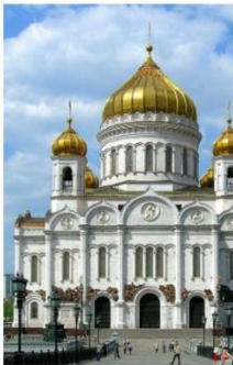
Christ the Saviour Cathedral